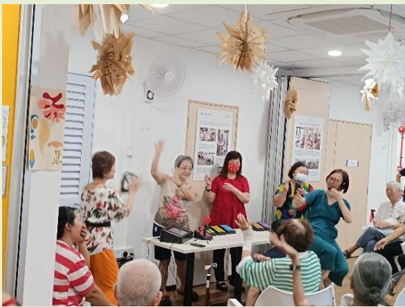
Seniors enjoying Music Therapy