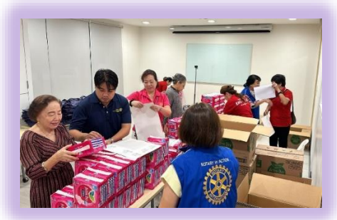
Packing the sanitary products for distribution

Rotarians and guest volunteers distributed more than 370 care packs. Some of the packs were also channeled to other community partners through our SG Cares Volunteer Centre @ Clementi for distribution.