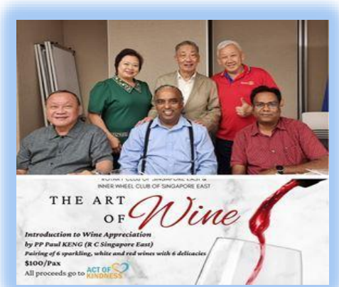
Collaborative activities with Act of Kindness Ltd