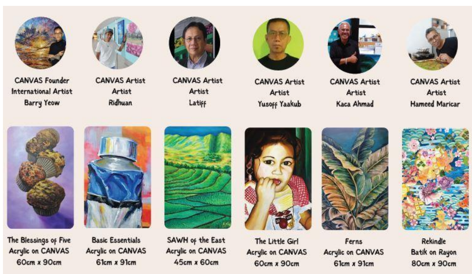
Art pieces done by ex-inmates