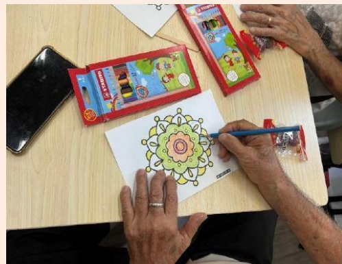
Festive occasion and the participants

The Rangoli activity allows participants to draw and colour designs to symbolize the festive occasion. The images together form beautiful tapestries reflecting the festive occasion and the participants' collective efforts.