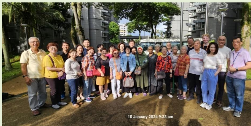
On a field trip

Creative programmes play an important role in fostering social connections. We sponsored trips to exhibitions at the museums, theatre shows and concerts. To imbue a sense of identity and cultural lineage, we also brought seniors to places such as Little India. We held art history discussions and special music therapy sessions. These sessions involved the use of musical instruments to motivate the participants to move and dance to popular tunes of yesteryear. A total of 2 art and 8 craft classes were facilitated. The average participant for each workshop is 13.