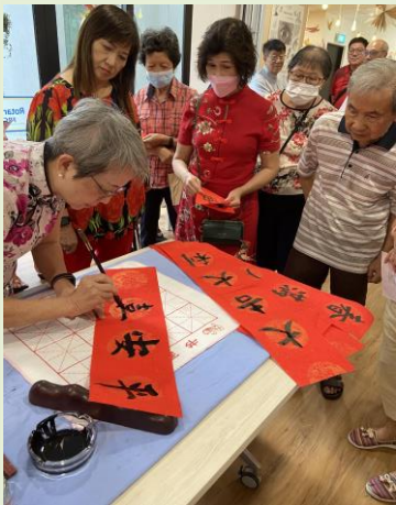
Members-led calligraphy session

FRCS AAC encourages residents to form special interest groups and guides them to take on leadership roles. One such group is the “Art Interest Group.” During its weekly group session, one member would be assigned to lead discussion on a topic. This initiative develops better communication, encourages cooperation and builds friendship amongst members. Following the success of this interest group, others were formed such as the “Chinese Calligraphy Interest Group” and “Ukulele Interest Group”.